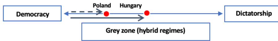
Figure 1. Kaczyński’s Poland and Orbán’s Hungary on the democracy–dictatorship axis. The Polish trajectory is a dashed line, the Hungarian a continuous line.

This presentation implies that Poland and Hungary are walking the same path—as if the same process is taking place in both countries, and the de-democratizing difference between them is only quantitative. But going from a single-level to a dual-level approach, and considering the presence or lack of patronal transformation, it can be seen that democratic backsliding in the two regimes indeed follows qualitatively different trajectories (figure 2).